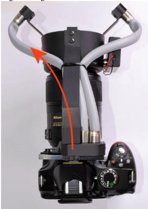
Position for Right Eye Side-Lighting