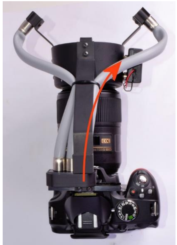
Position for Left Eye Side-Lighting